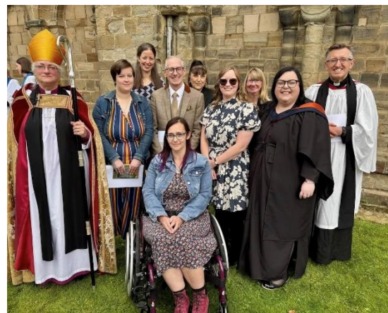
Authorised Children's Ministers 2025

Commendation from your Incumbent or similar is needed for all participants and all course participants must have a valid DBS certificate and have completed relevant safeguarding training, in line with diocesan policy on safeguarding.